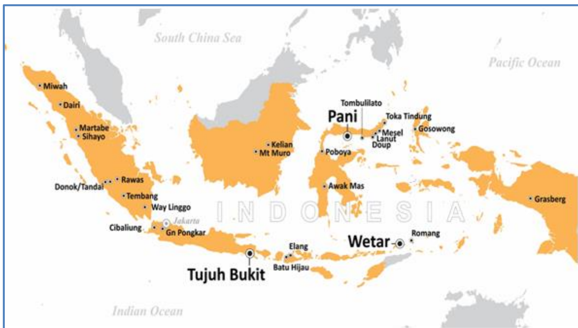
Figure 1: Merdeka Exploration Locations

Copper and Gold: The Upper High Grade Zone (UHGZ) of the Tujuh Bukit copper and gold porphyry resource is being explored through a combination of surface and underground drilling.