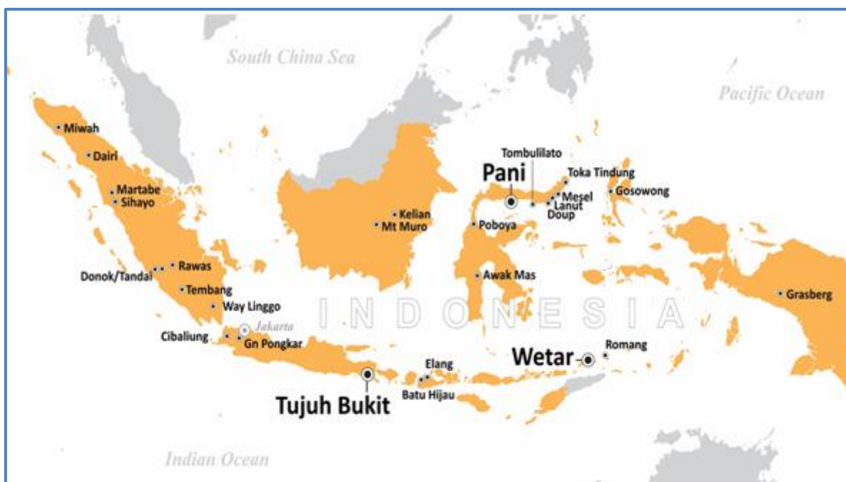
Figure 1: Merdeka Exploration Project Locations

The total spending on exploration in Indonesia by Merdeka in the month of March 2020 is approximately Rp 29.1 billion.